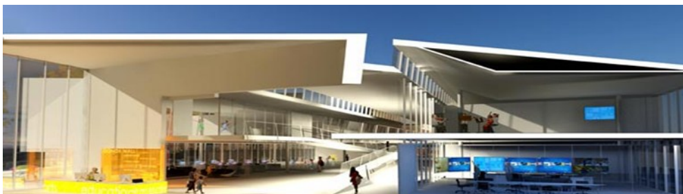
*Artist's Conceptual Rendering of Grand Atrium and Public Entry to Sorenson Complex

With the selection of the architectural firm and contractor for the Beverley Taylor Sorenson Arts and Education Complex, the new facility is on track for groundbreaking in summer 2011 and occupancy by late 2012. EDA Architects and Okland Construction have been selected to design and build the new, world-class facility. EDA is a long-standing Salt Lake City-based architectural firm with over 50 years of experience in planning and designing facilities throughout the intermountain west, including the Salt Palace Convention Center Expansion, Historic Ogden High School Restoration, Uintah Recreation Center, University of Utah College of Pharmacy, Antelope Island Visitors Center, Joe Quinney Winter Sports Center and Alf